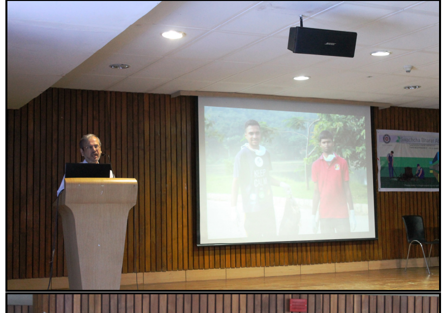
Address by the Director