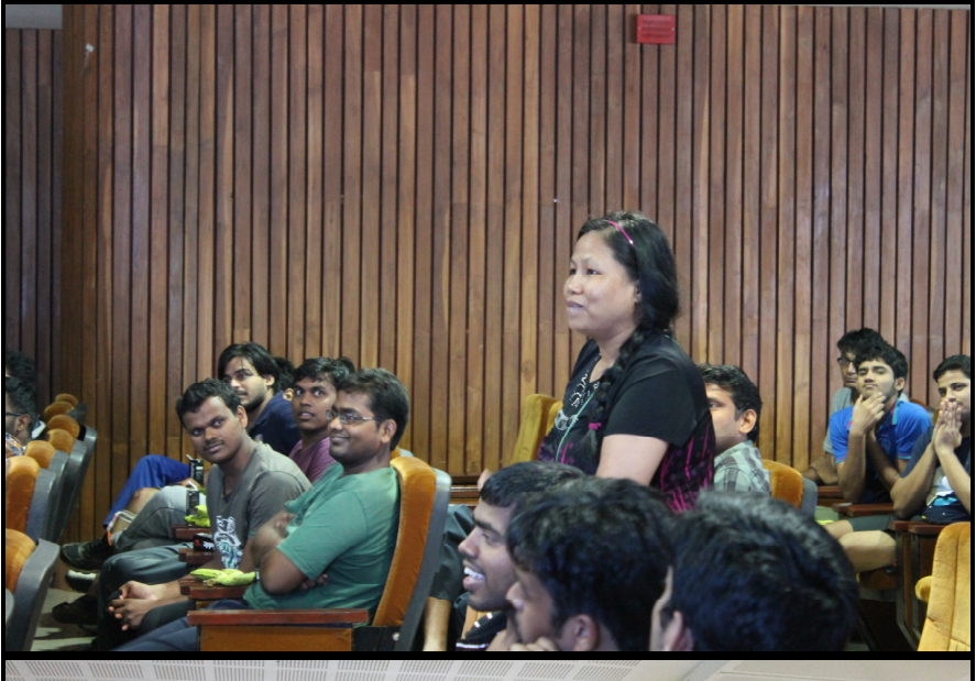
Questioning hour on cleanliness of campus and neighbourhood