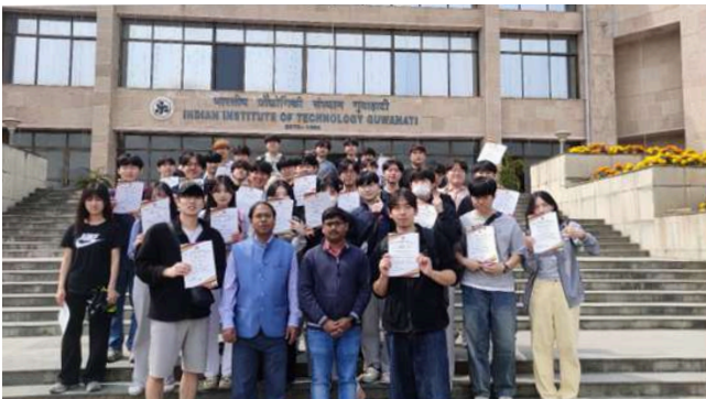
34 UG Interns from Hanyang University, South Korea , Dept - EEE, CL; 22nd Jan to 29th Feb, '24

Total students registered in different programs in the year 2024 is 10 (Ten) and Short term visitors 30+ students.