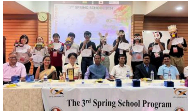
3rd Spring School 2024, Gifu University MEXT funded; 4th - 15th March, '24