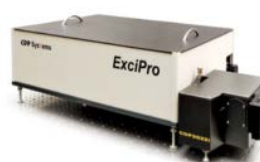
Transient Absorption Spectrometer & Time-Resolved Spectrometer