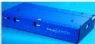
Dye Laser & Fully Automated Ti:Sa CW Ring Laser