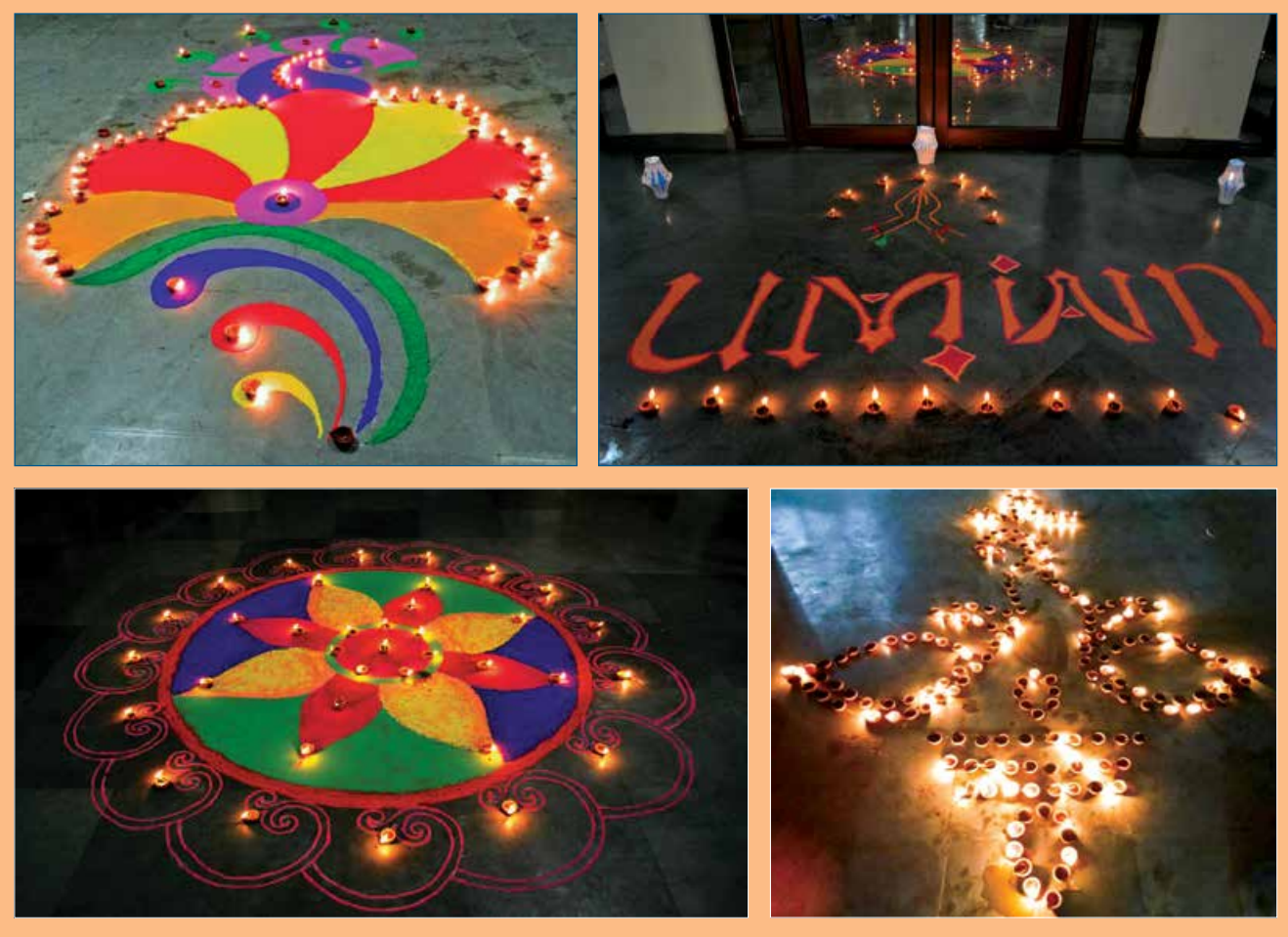
Diwali Celebrations across various hostels of the Institute