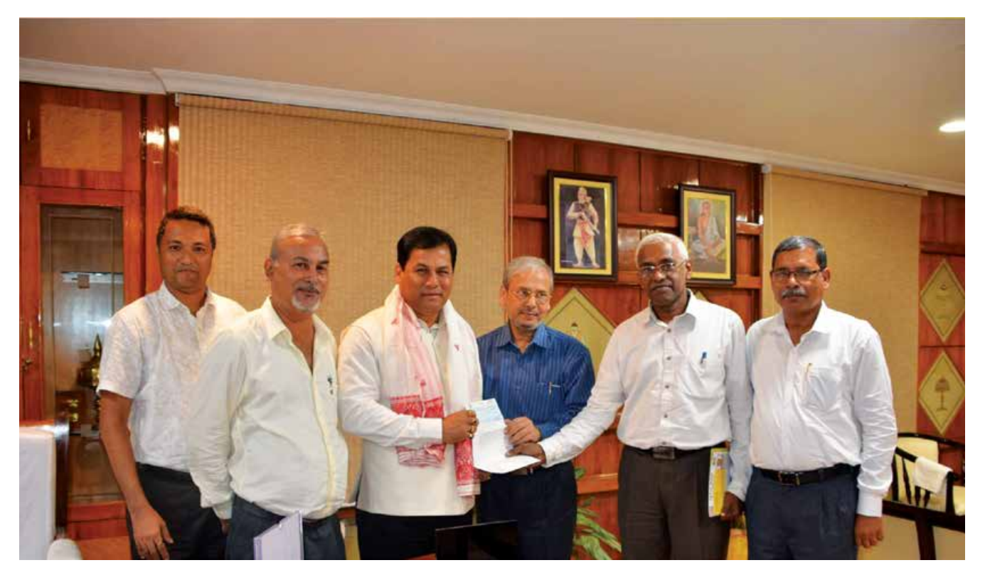
A team lead by the Hon'ble Director of IITG, Prof. Gautam Biswas met the Hon'ble Chief Minister of Assam, Shri Sarbananda Sonowal to hand over a cheque, as a token of contribution for the flood affected people of Assam, to Chief Minister's flood relief fund, collected through voluntary contribution from the IIT Guwahati community.