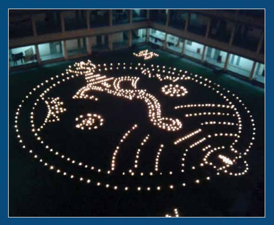
Festivity at Umiam Hostel