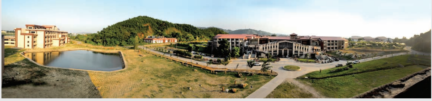
Panaromic view of the Academic Complex and the Computer and Communication Centre, IIT Guwahati