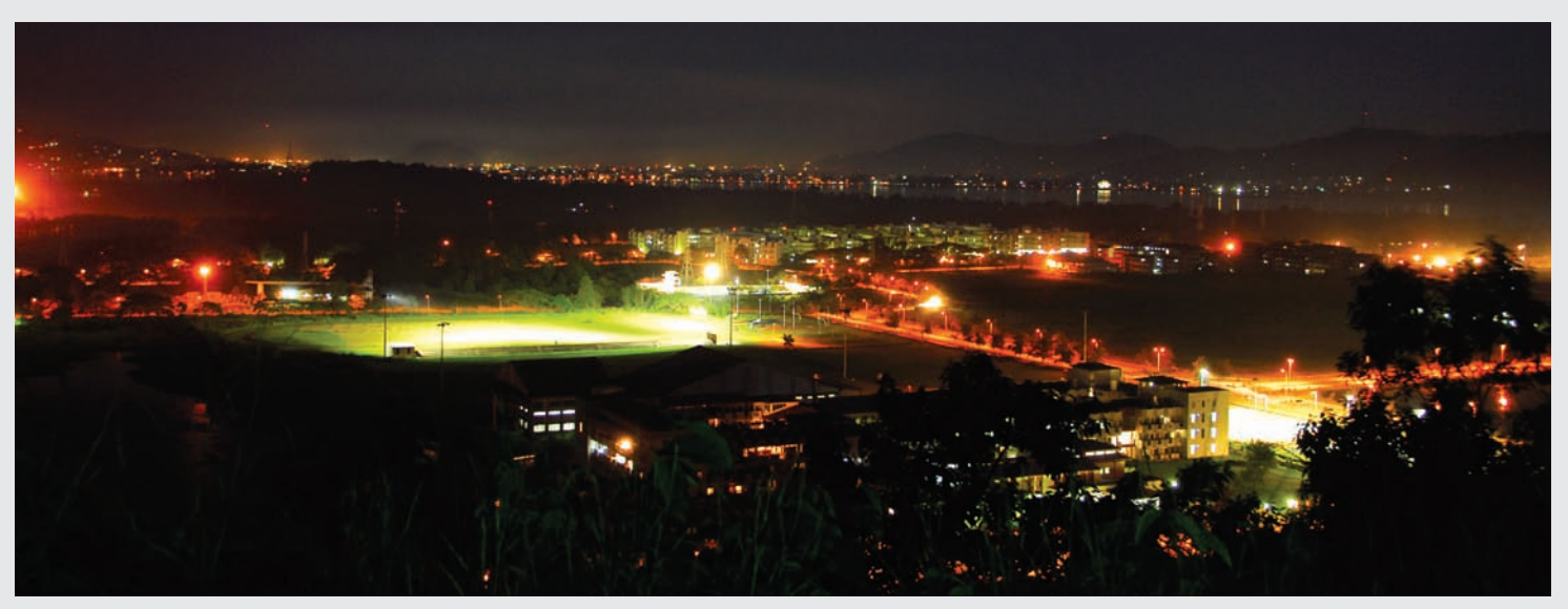
Night view of IIT Guwahati