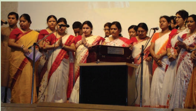
Campus residents performing during Rabindra Jayanti celebration

The 150th Birth anniversary of Rabindra Nath Tagore, the first Nobel laureate of India in literature was celebrated by the IIT Club on 15 May 2010. Members of the IITG fraternity participated in the function. The cultural programme included dance performances by a group of campus children based on Rabindra Sangeet, chorus, recitation of poems penned by the maestro and rendition of a few Rabindra Sangeet.