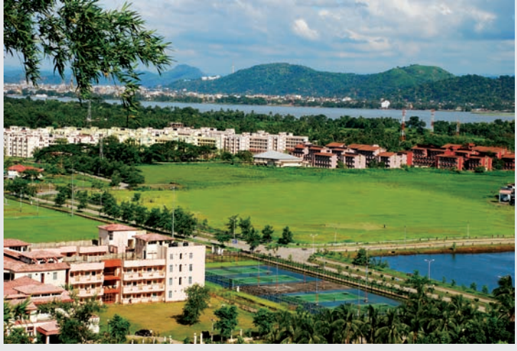
Sports fields with Girls' Hostel in the foreground and Boys' Hostels in the background