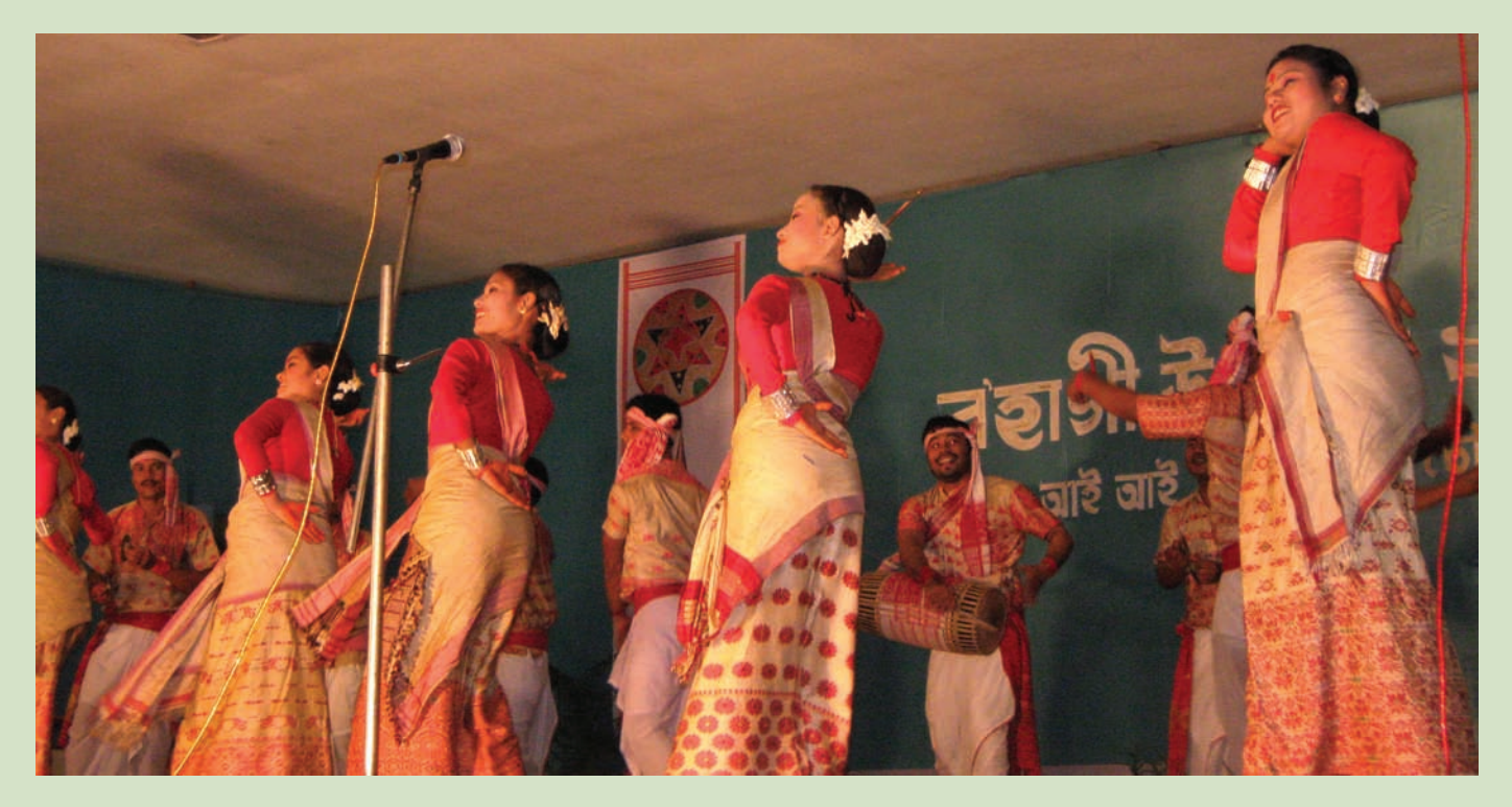
Husori performance during Bohagi Utsav 2010

Bihu is the biggest festival of the people of Assam and transcends all religious and class barriers bringing people together. The Assamese people observe three different types of Bihu during the year, each marking an agricultural activity and denoting a change of season.