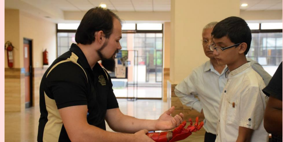
LIMBITLESS SOLUTIONS, Team behind the famous Iron Man presthetic arm