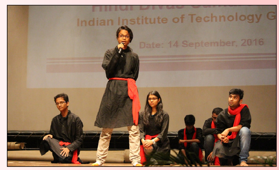
IITG Monitor ¶ Indian Institute of Technology Guwahati.