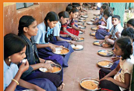
Fair & Accessible